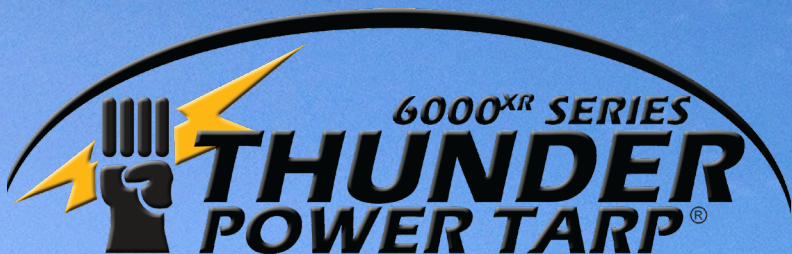
Standard Mill Finish - 01